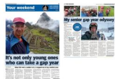
Your Weekend. Sunshine Coast Daily, 03/03/2018