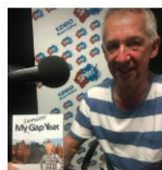
My Senior Gap Year on Spirit Radio 1260 Karratha, Western Australia - 09/04/2018