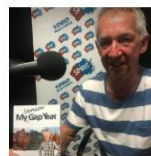
My Senior Gap Year on Spirit Radio 1260 Karratha, Western Australia - 09/04/2018