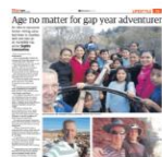
Pilbara News, 25/04/2018