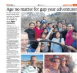
Pilbara News, 25/04/2018