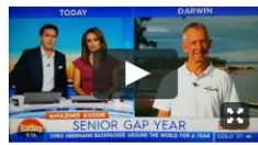
Weekend Today Show, 13/01/2018 Channel 9. Australian National Television.