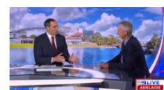
9 News Adelaide, 01/06/2018

For a complete list of media interviews please click here: http://myseniorgapyear.com/media/